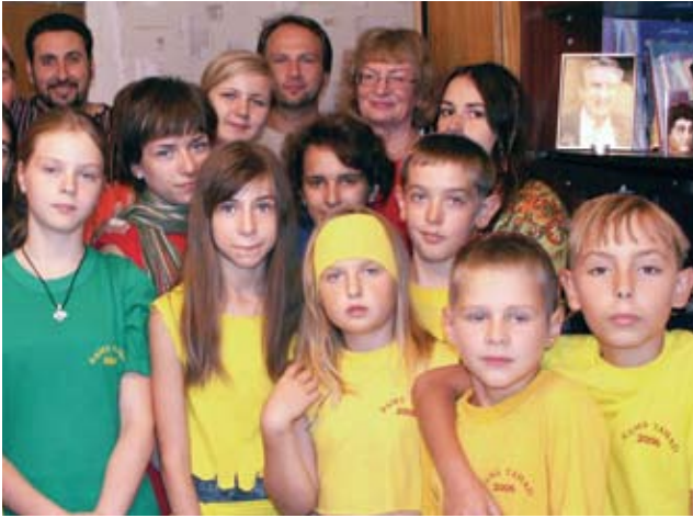
A first introduction to the David Clayman z'l Library, Kiev Cultural Center